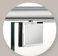
Top Pivot Detail

Some applications are best suited for a door that pivots. WaterFall meets this need by mounting pivot hinges directly into a matching "Heavy Glass Header" created from extruded aluminum and finished in an anodized or powder-coat finish perfectly matched with WaterFall hardware. Specially designed brackets attach the header to the wall with no visible screws.