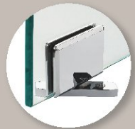
Bottom Pivot Detail