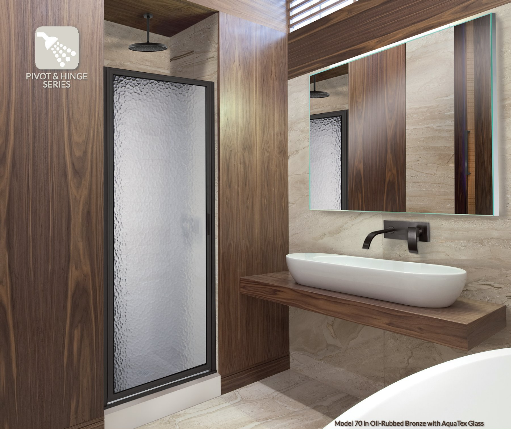
Model 70 in Oil-Rubbed Bronze with AquaTex Glass