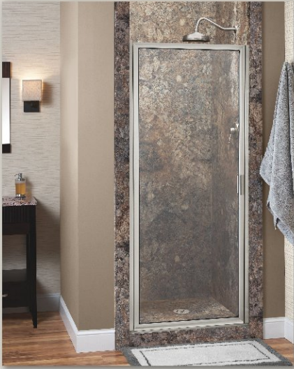
Model 70 in Brushed Nickel with Clear Glass*