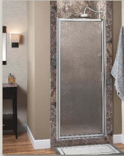
Model 70 in Polished Silver with Rain Glass*