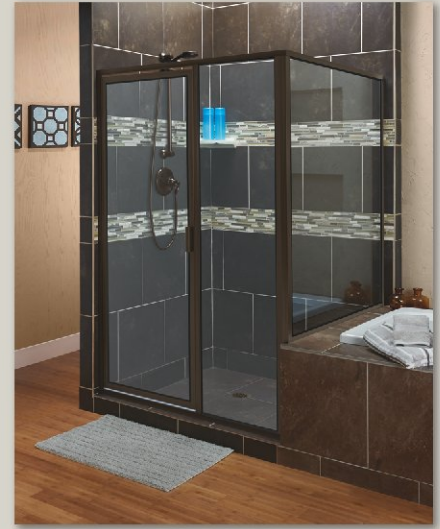
Model 79C with In-Line & Return Panels in Oil-Rubbed Bronze with Clear Glass*