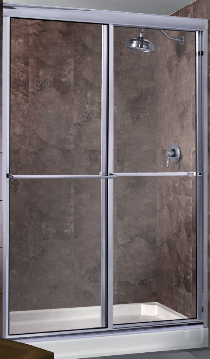
Model 65 In Polished Silver with Clear Glass