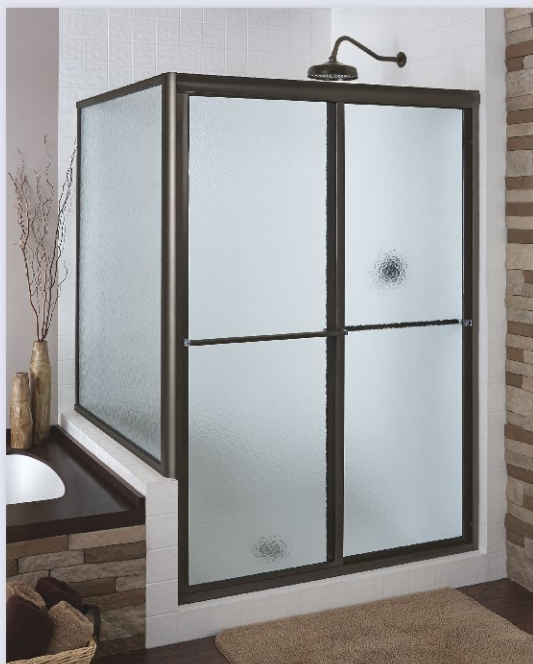
Model 65 with Return Panel Shown in Oil-Rubbed Bronze with Aqua-Tex Glass* Also Available with In-Line Panel for Shower Seats