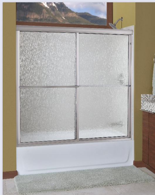
Model 64 for Bathtubs Shown in Brushed Nickel with Rain Glass*