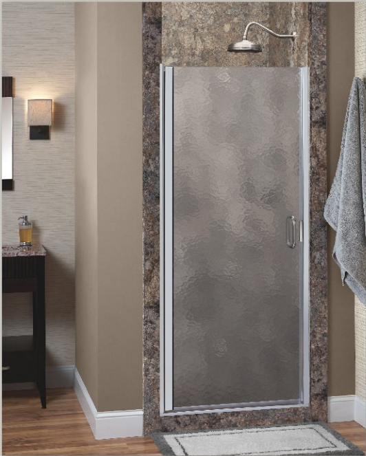
Model 30D Shown in Polished Silver with Aqua-Tex Glass*