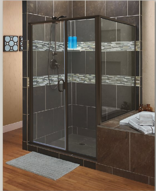
Model 39D for WaterStall Enclosures Shown in Oil-Rubbed Bronze with Clear Glass* A slight variation of the Model 30D, the door is resized and snap-in inserts are added to the header and curb. Reference literature for Model 01, 03, 03B and 04 for more details.